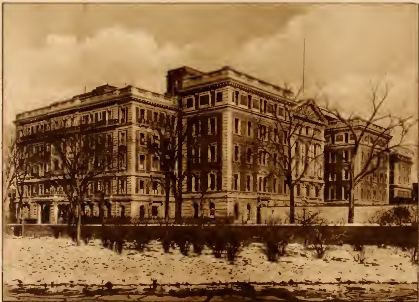
MT. SINAI HOSPITAL, 110th Street and 5th Avenue.